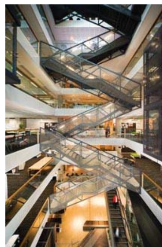
Santos Adelaide, BVN Architecture