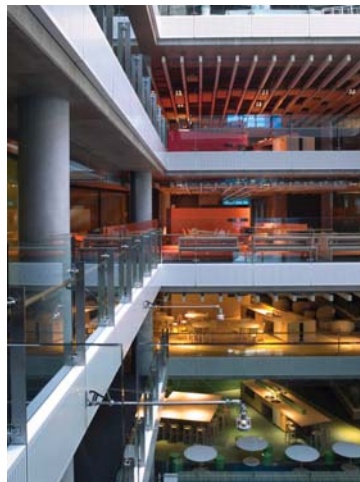
SA Water, Adelaide, Architect: Hassell, Photo Credit: Earl Carter